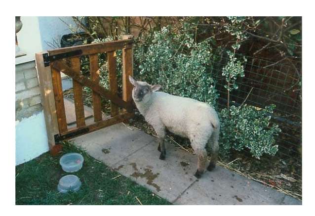
Yes, that is me above in my Bristol house and below near Shaftesbury.