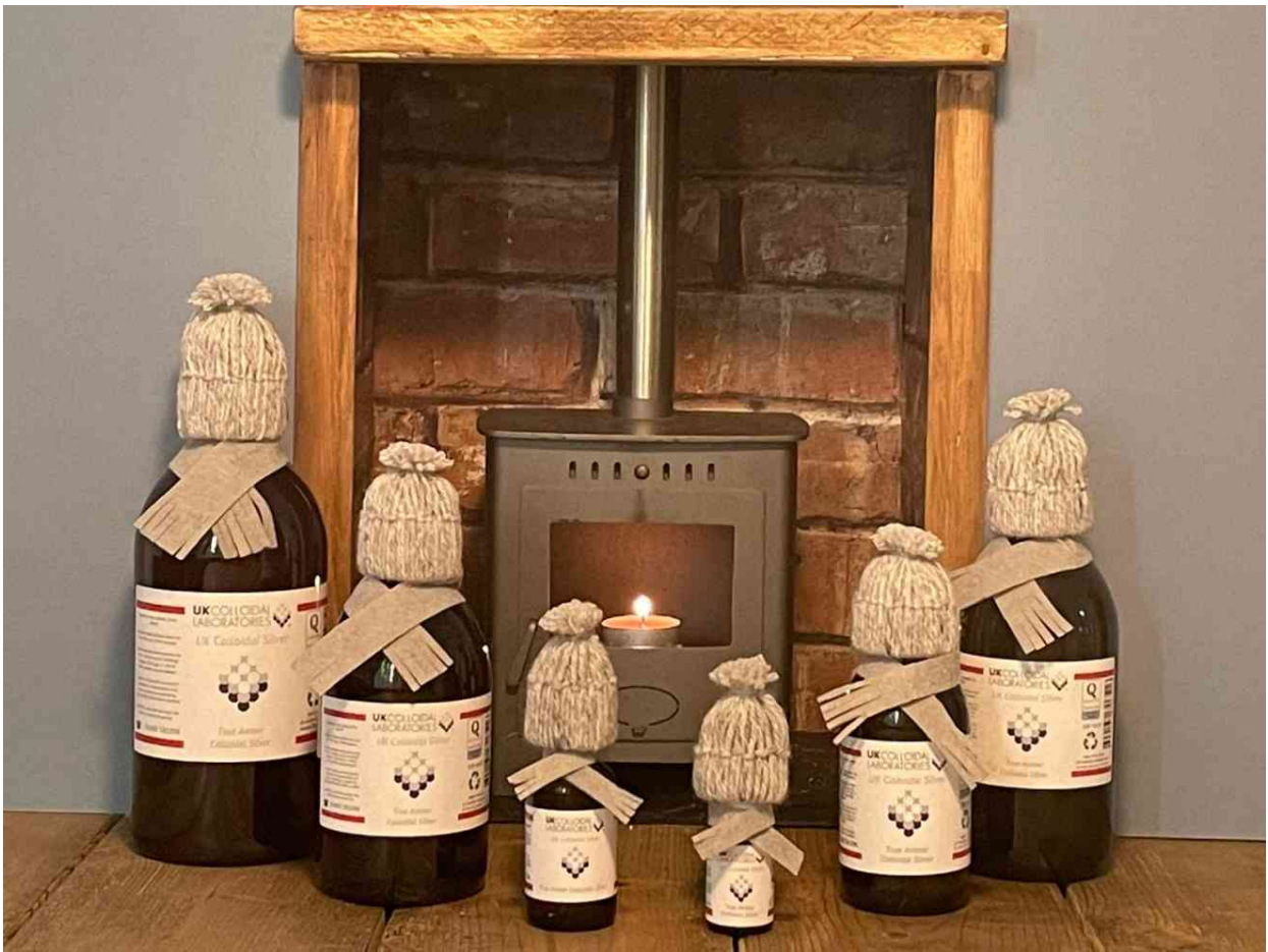
A rare family picture taken on Xmas day.